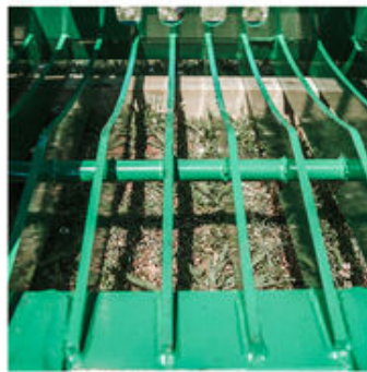
3" open tine bottom for sifting debris