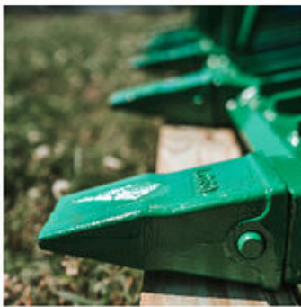
4 replaceable teeth