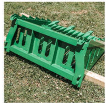
Fits John Deere hook and pin style carriers